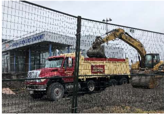
The PT team on the Kingston airport expansion YGK. photo by Picton Terminals

The ice is out of the Bay and Picton Terminals is shifting to new and exciting projects. We completed our work supporting the Amherst Island Wind Farm and are newly focused on supporting the expansion of Kingston's Airport YGK. Additionally, we have a few more loads of surplus limestone to deliver to