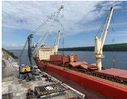
Offloading steel from the Federal Rhine using our new shore crane, the Liebherr LHM420. Aug. 2019

Decades ago, Cruise ships traveled the Great Lakes. Twenty years ago, a modern vessel resumed the Great Lakes cruising adventures. Today, interest in Great Lakes cruising is higher than ever before, and the industry is expecting a boon in the next several years. Currently, half a dozen ships tour the Great Lakes, but new ships are under construction to serve the Great Lakes cruising market. Great Lakes cruise boats are very different from the cruise boats