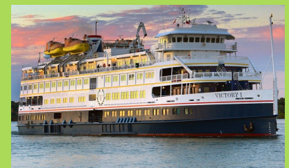
MS Victory 1