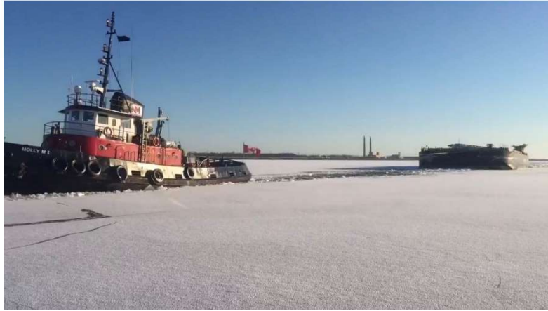
SLS ice breaking to support the Molly M tug and Newfoundland barge, back and forth to Toronto harbour.

The PT Team and especially the Sheri Lynn S Crew have been busy throughout our icy winter. The opening of the St. Lawrence Seaway and the resumption of shipping across the Great Lakes is always cause for celebration. It takes a large team to help get the vessels moving. Everyone from the Coast Guard in the St. Lawrence River to the draining and refilling of the Welland Canal helps to reopen HwyH2O to shipping and commerce to 8 US states and 2 provinces which border the Seaway. The SLS Crew played a small part in the reopening of the shipping season by breaking ice at Lafarge to assist their first vessel of the season to dock safely and helping the Molly M and barge (above) get back and forth to Toronto harbour.