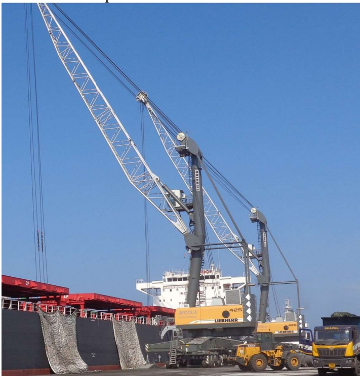
Liebherr LMH 420 mobile crane.

Picton Terminals is proud to own Liebherr cranes, including the new LHM 420 Mobile Harbour Crane which provides PT with flexibility in the types of services delivered at the port.