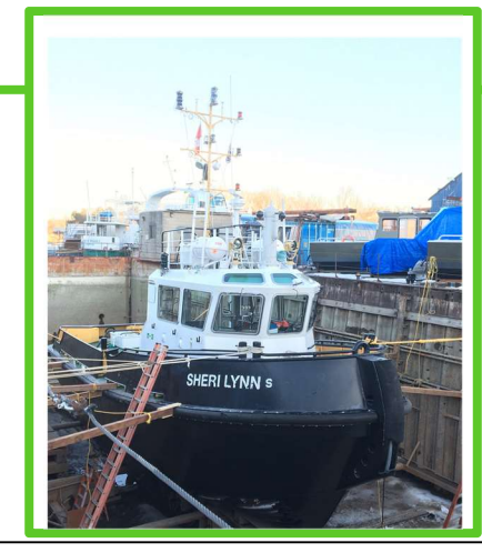
Sheri Lynn S is dry docked in Kingston, at MetalCraft Marine.

Picton Terminals' new tugboat Sheri Lynn S is receiving some TLC after a successful first winter breaking ice between Picton and Kingston. Her crew will now shift duties to assist larger vessels as they navigate HWY H2O.