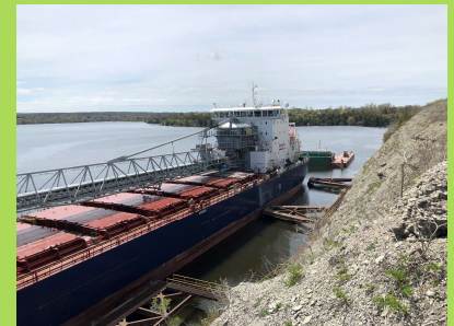
Algoma Conveyor May 2019

Picton Terminals is planning several 2019 Open Houses to watch the vessels arrive and offload.