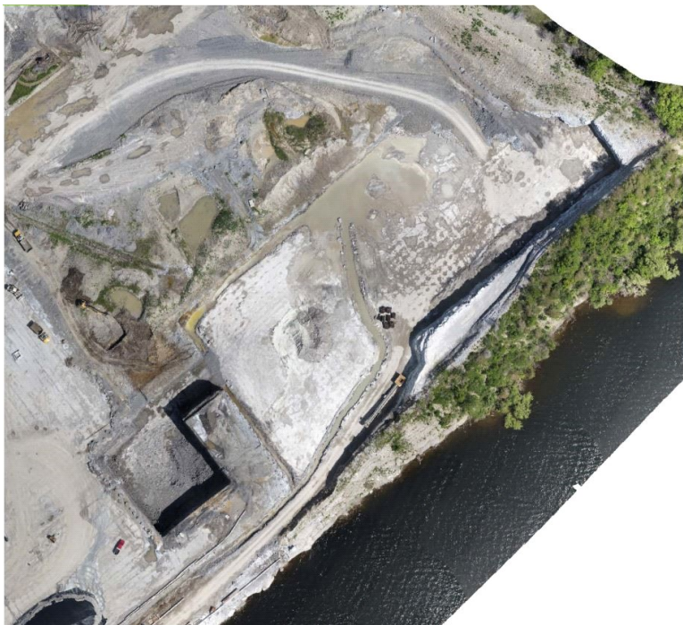
DroneDeploy June 12, 2019.

The longer the legal proceedings take, the longer the Dry Storage construction will take.